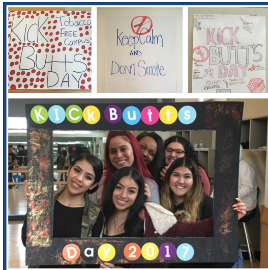
The SBHC's Youth Advisory Board members run a Kick Butt's Day event in March 2017.

The Sylvester Greenwood School-Based Health Center was founded during the 2015—16 school year as part of West Contra Costa Unified School District's Full Service Community School initiative. The health center supports students to meet the challenges in their lives and also works closely with faculty and administrators campus-wide to build a strong and positive culture to support school success for all students.